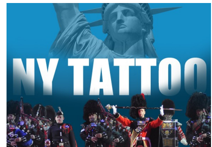
Details of entire Tattoo can be found at: http://www.tartanweek.com/tattoo/