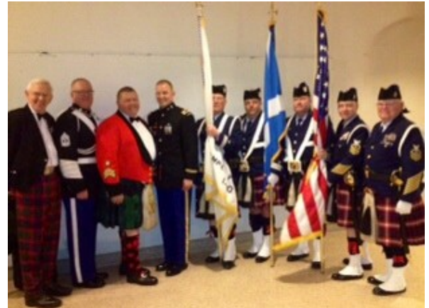
Color Guard Team Poses with Dignitaries from Scotland and the West Point "Hellcats" New York, NY 2014

Color Guard team returned with colors prior to the curtain call to be front and center for final tribute with the entire Tattoo cast. Post show, the USCGPB Color Guard Team posed for several photos.