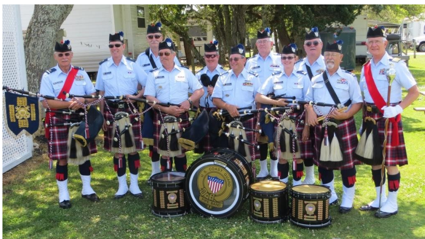
USCG Pipers and Drummers pose for group photo. British War Graves Memorial, Ocracoke, NC 2014

On May 8th and 9th, twelve U.S. Coast Guard Pipe Band members gathered on the Outer Banks of North Carolina to perform at the memorial services at the British War Graves in Buxton and Ocracoke, NC. These two services honor British and Canadian sailors who lost their lives in World War II while helping guard our shores from German U-boats. In keeping with naval military tradition, the U.S. Coast Guard maintains the cemeteries.