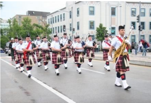
National Law Enforcement Memorial Parade Washington D.C. May 2013