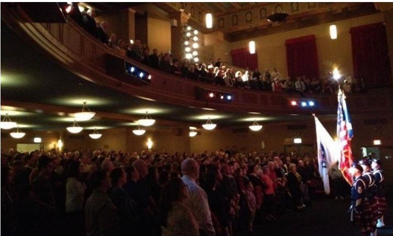
Color Guard Team Presents Colors at NYC Tattoo Mason Hall Theater, New York, NY 2014