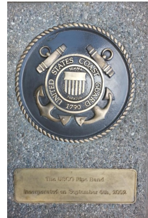
USCGC Pipe Band Memorial Grand Haven, MI 2013