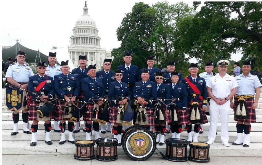
Bottom: U.S. Coast Guard Pipe Band Assembles for Photo Washington, D.C. May 2014