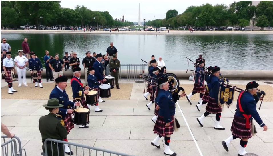
Top: USCG Pipe Band stepping off for FOP National Pipe Band Competition

Seventeen of the band's members traveled from diverse locations such as California, Washington, Missouri, New York, Arizona, Georgia and Florida to perform. In addition to the competition, the band also performed at the National WWII Memorial, the Fraternal Order of Police's "Tent City", the Emerald Society Parade and Annual Memorial Service.