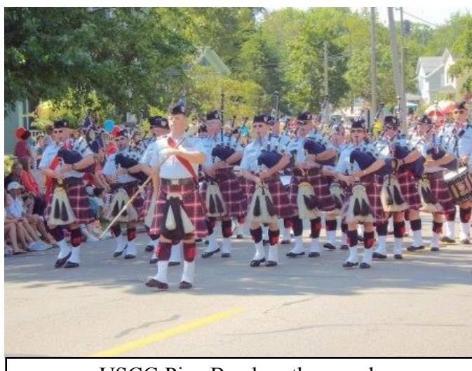
USCG Pipe Band on the march