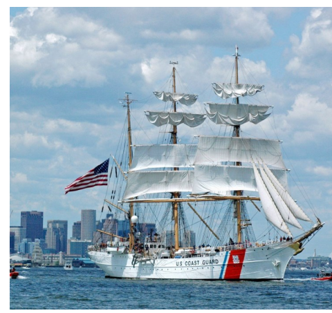
CGC BARQUE EAGLE in Boston Harbor (http://go2.guide/events/sail-boston)