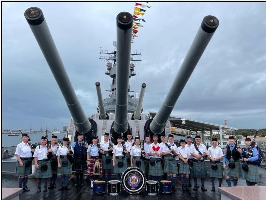
Ceremony Pipe and Drum band members from Honolulu on the main deck of the USS MISSOURI.