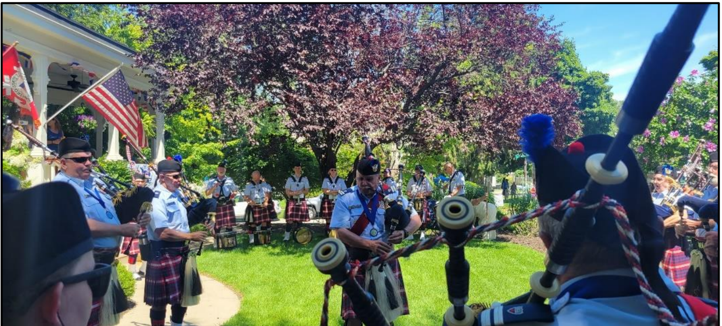
A great end to a great couple of days in Grand Haven...the Boyden House final performances before concluding the 20 th year of the U.S. Coast Guard Pipe Band participation at the Grand Haven Coast Guard Festival.