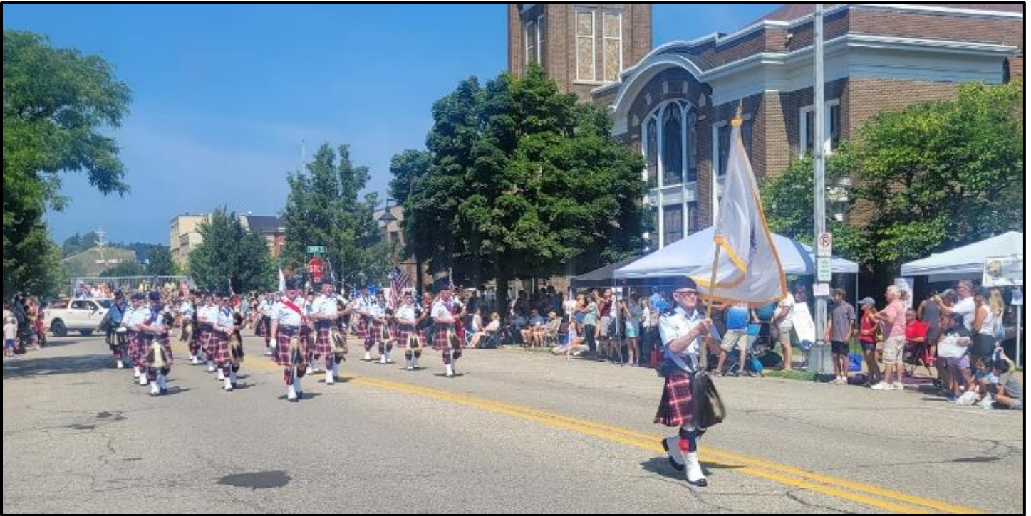
On the march heading up the hill to the Reviewing Stand.