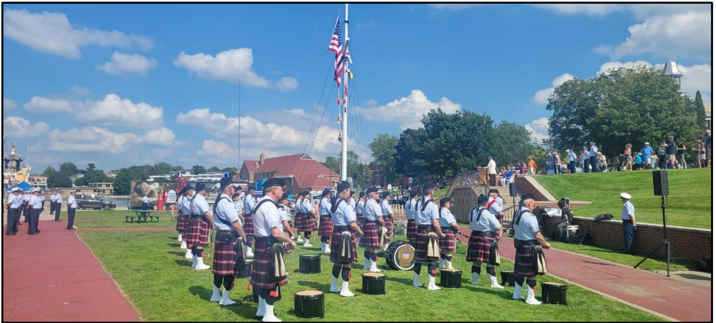
USCGPB members stand easy during the 2022 National Memorial Service.