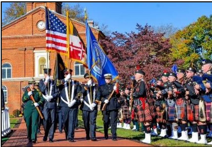
The various Fire Department pipes & drums play the Color and Honor Guards into the Honor ceremony on Sunday, 9 Oct 2022.