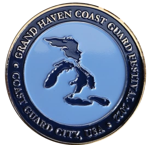
Medallion present to USCGPB members prior to Festival parade.