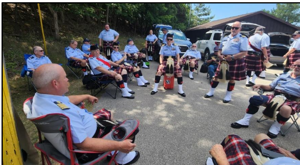
BOTTOM: The local American Legion Hall hosts the community following the Memorial Service with a chicken dinner. But most importantly, their shady parking lot is the final staging location for the band for tuning and a final kit check before walking across the street to perform in the Memorial Service. Band members relax before getting the call to attention from the PM to form up.