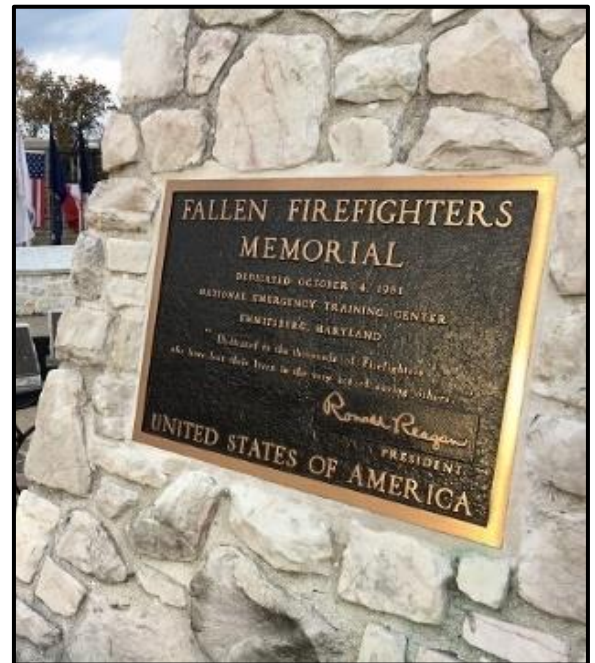
ABOVE: The National Fallen Firefighters Memorial is located on the campus of the National Fire Academy in Emmitsburg, MD.